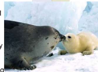
A mother seal with her baby

The annual seal hunt greatly affects people (and seals) all around. It is significant because the seal population is dropping drastically, and innocent seals are being brutally killed for no reason. The seal hunt has affected the individuals and seals involved, because the fishermen killing the seals are just making money off of the pelts and nothing is stopping them from going back and repeating the cycle every year. This issue also impacts society today by wasting Canadian taxpayer dollars. We should all try our best to fight against the seal hunt and try to stop it!