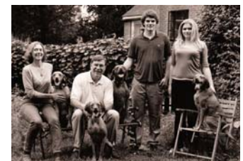
The Greene Family at home.

By the way, the weirdest food that Dr. Greene likes is cow tongue with mustard!