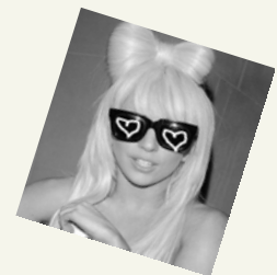
Maybe you would like to be "Gaga" for Halloween.