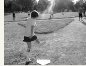
Join a kickball game at recess!

In addition to what we do at recess I would want to have a trampoline (the extra bouncy kind), a pool (a super long one), and of course a tree house (a really big one). That would be my kind of recess if I were in charge.